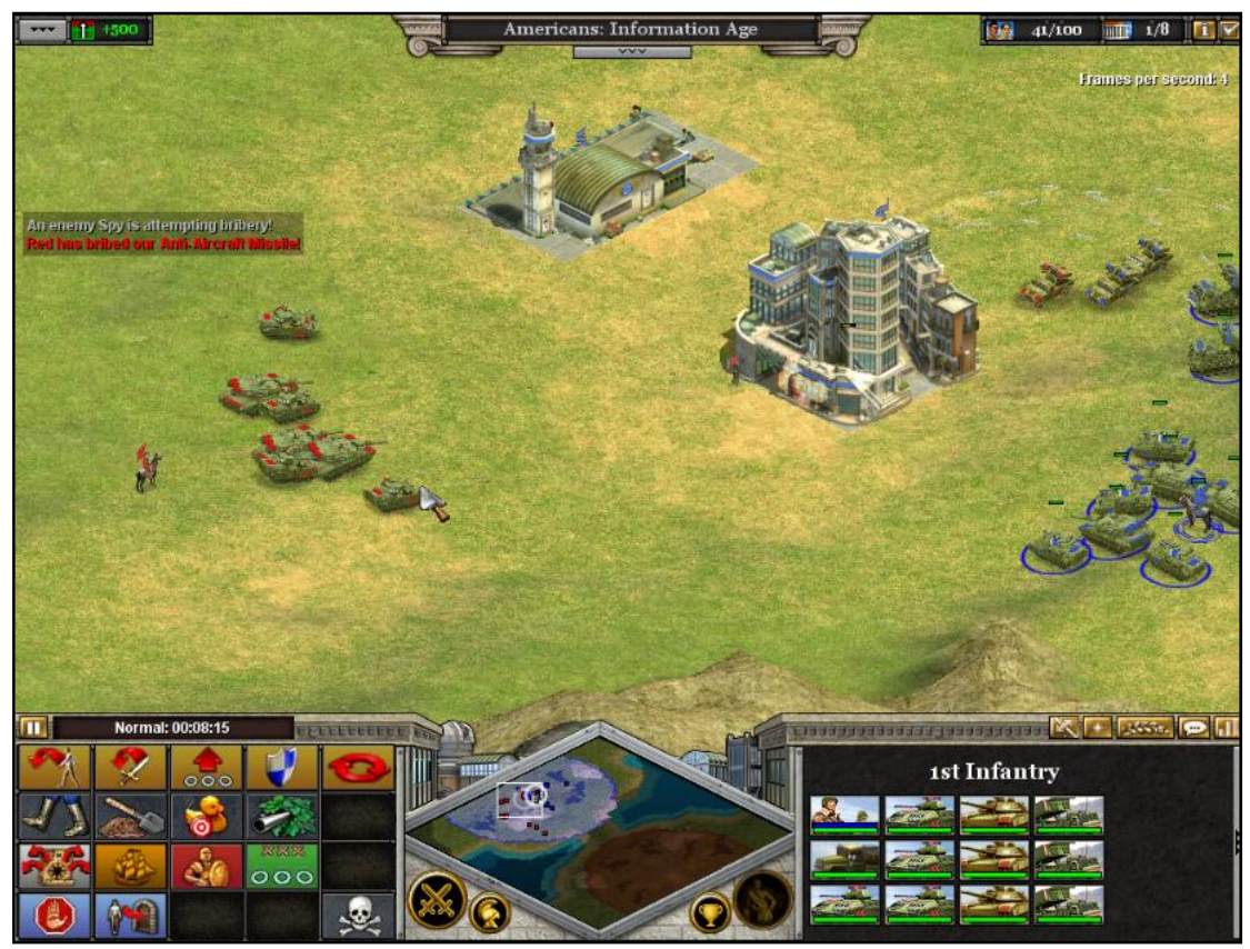
Figure 2.1: Game scenario and interface in Rise of Nations, © Microsoft Corporation.

In these trials, participants were tasked to destroy and capture the enemy's city by occupying it with at least three infantry or armor units. They were presented with a map of the scenario and were given a list of the type and number of units and installations available in the game. The Gamer simulated a consistent adversary by following several opening moves based on a predetermined set of enemy's intentions. In the first four games, the Gamer would always send armored forces to attack the participant's northern defenses while launching a simultaneous air attack on the participant's airbase. From the fifth game onwards, the Gamer executed another script by sending armored forces from the south to attack the participant's airbase. This was designed to capture how people reacted to changes and how they calibrated themselves to the change.